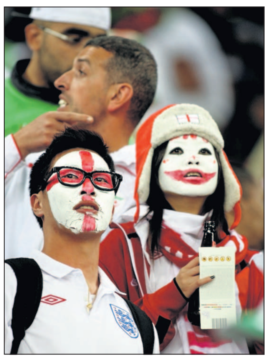
The Fifa Soccer World Cup brought visitors from far and wide

"While we will continue our mandate to increase tourist arrivals year-on-year, we've acknowledged the need to embrace innovative and engaging strategies in order to achieve this." she said.