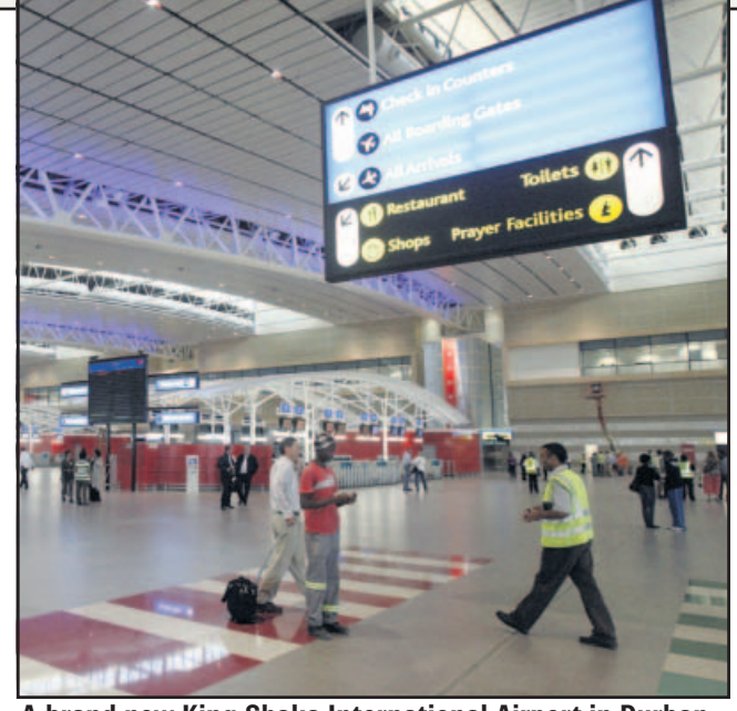
A brand new King Shaka International Airport in Durban was completed on time at a cost of R7,2 billion.

All the airports were completed on deadline, with new systems upgraded to handle thousands of soccer fans who