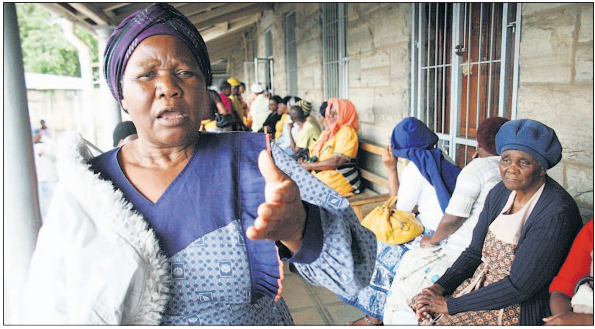
The Department of Social Development scooped the Gold award for Community Engagement